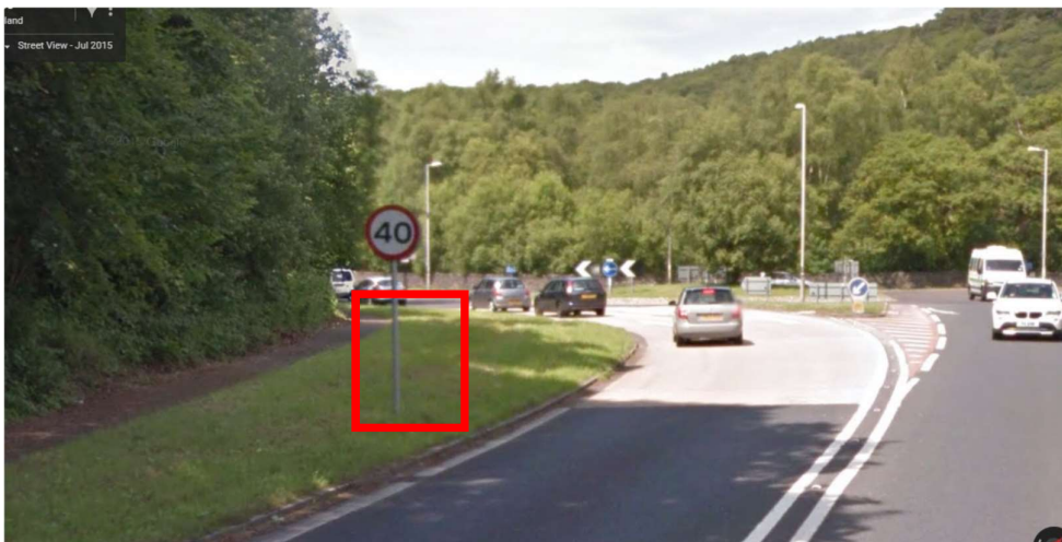
Sign 6 – On the north side of the roundabout to alert traffic heading south on the A592.