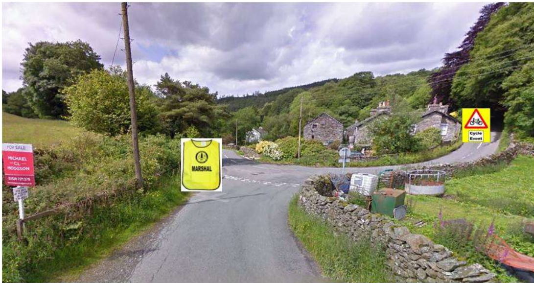
Pic 6. View from Grizedale side...