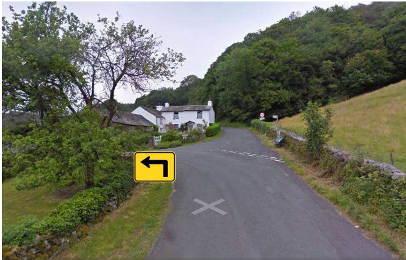
Pic 4. Sign 3 – Arrow sign after steep hill just out of Rusland to take riders left towards Force forge and not straight on towards Dale Park